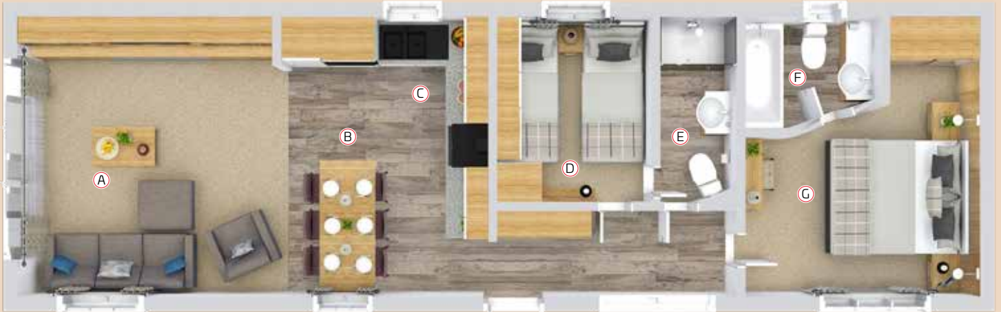
Model illustrated 43ft x 13ft – 2 bed

A Lounge with luxury velvet designer freestanding sofa, chair and footstool complete with coffee table.