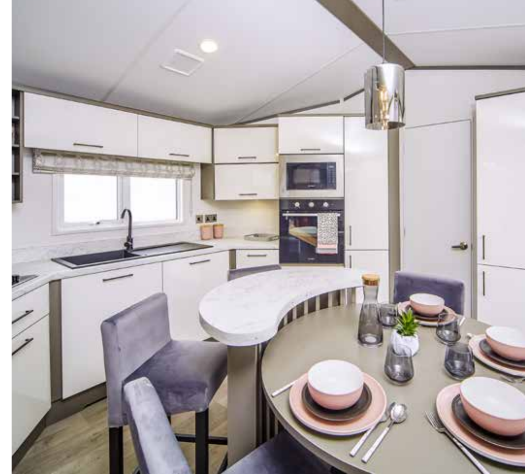
The Status 4 kitchen is unique in the range with its curved breakfast bar which can be specified with 2 bar stools as an option. The kitchen is of a high specification incorporating high level oven, grill and microwave, 4-ring hob and integrated fridge/freezer.