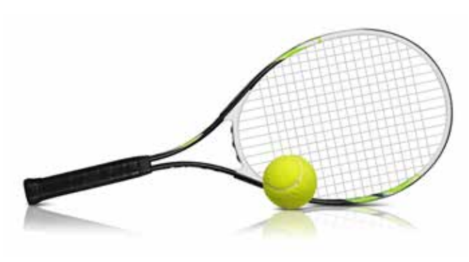
With lots of great facilities at holiday parks around the country, you and your family will never be short of things to do.

The Sherwood Lodge 7 is the perfect lodge for the whole family and the perfect place to relax and leave the stresses of modern life behind.