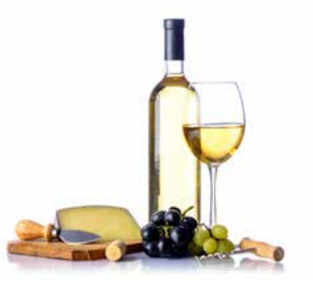
Watch the sun go down over a glass of wine. What better way to enjoy a summer's evening than in your Ovation Lodge.