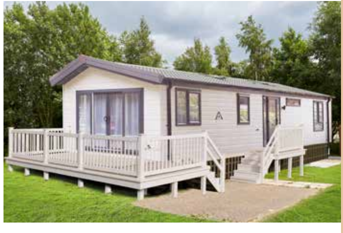
The Ovation Lodge 6 illustrated is the 43ft x 13ft. It has 2 bedrooms with windows and doors finished in optional graphite.

Note: Deluxe bedding set, lounge scatters, TV and interior accessories are for display purposes only.