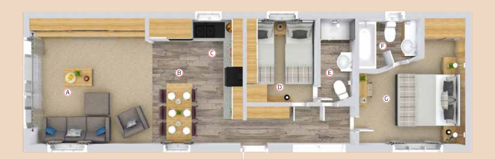
Model illustrated 43ft x 13ft - 2 bed