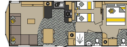
32 X 12 2B Bed Sizes: King size 1905mm x 1525mm & 2 x Single 1830mm x 685mm