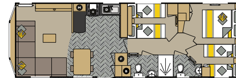
36 X 12 3B Bed Sizes: Double 1905mm x 1370mm, 2 x Single 1830mm x 685mm & 2 x Single 1830mm x 610mm