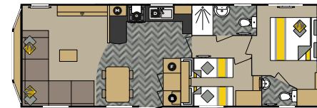
35 X 12 2B Bed Sizes: King size 1905mm x 1525mm & 2 x Single 1830mm x 685mm