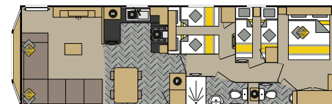
38 X 12 3B Bed Sizes: King size 1905mm x 1525mm, 2 x Single 1830mm x 685mm & 2 x Single 1830mm x 610mm