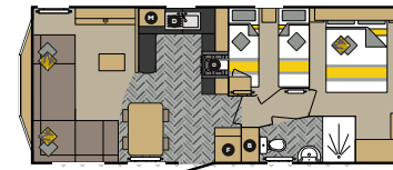
28 X 12 2B Bed Sizes: Double 1905mm x 1370mm & 2 x Single 1830mm x 685mm