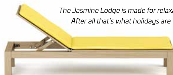
The Jasmine Lodge is made for relaxation. After all that's what holidays are for.

After an absence of a couple of years, the brand new, re-imagined Jasmine Lodge 2 really is the ideal luxury holiday home to sit back, relax and enjoy life to the full.