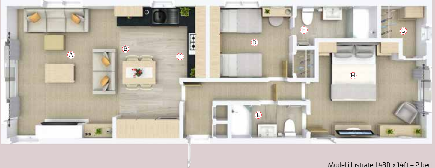
Model illustrated 43ft x 14ft – 2 bed

A Lounge with 2 seater sofa and 3 seater sofa with pull out bed, designer scatter cushions and sliding front patio doors.