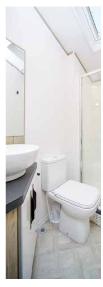
If you're looking for the ultimate luxury in a holiday home, the Image 9 ticks every box.

All bathroom fittings throughout the Image 9 are an on-trend matt black finish.