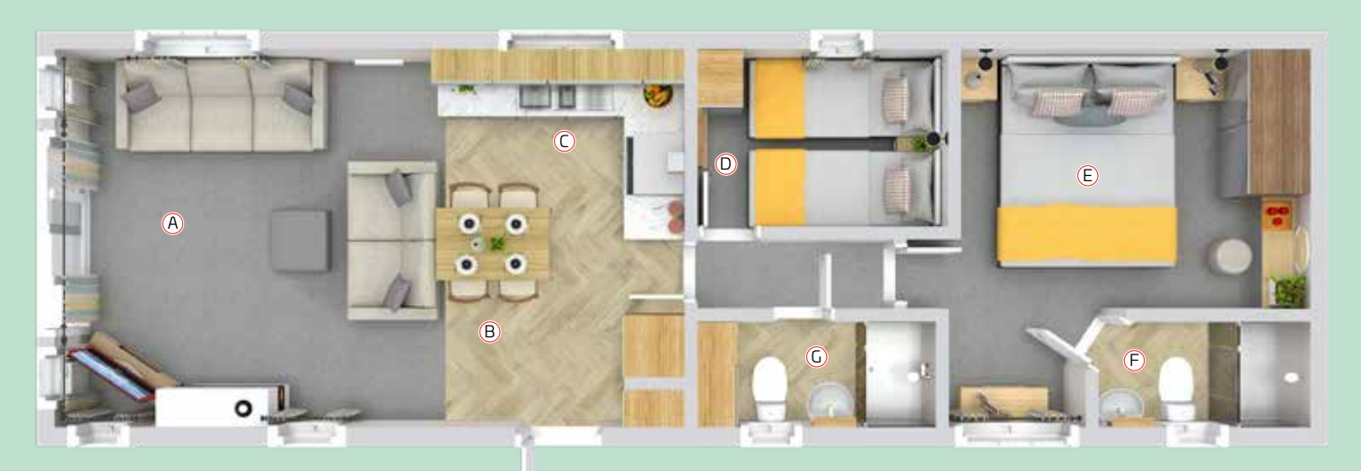
Model illustrated 39ft x 12ft – 2 bed with 2 showers