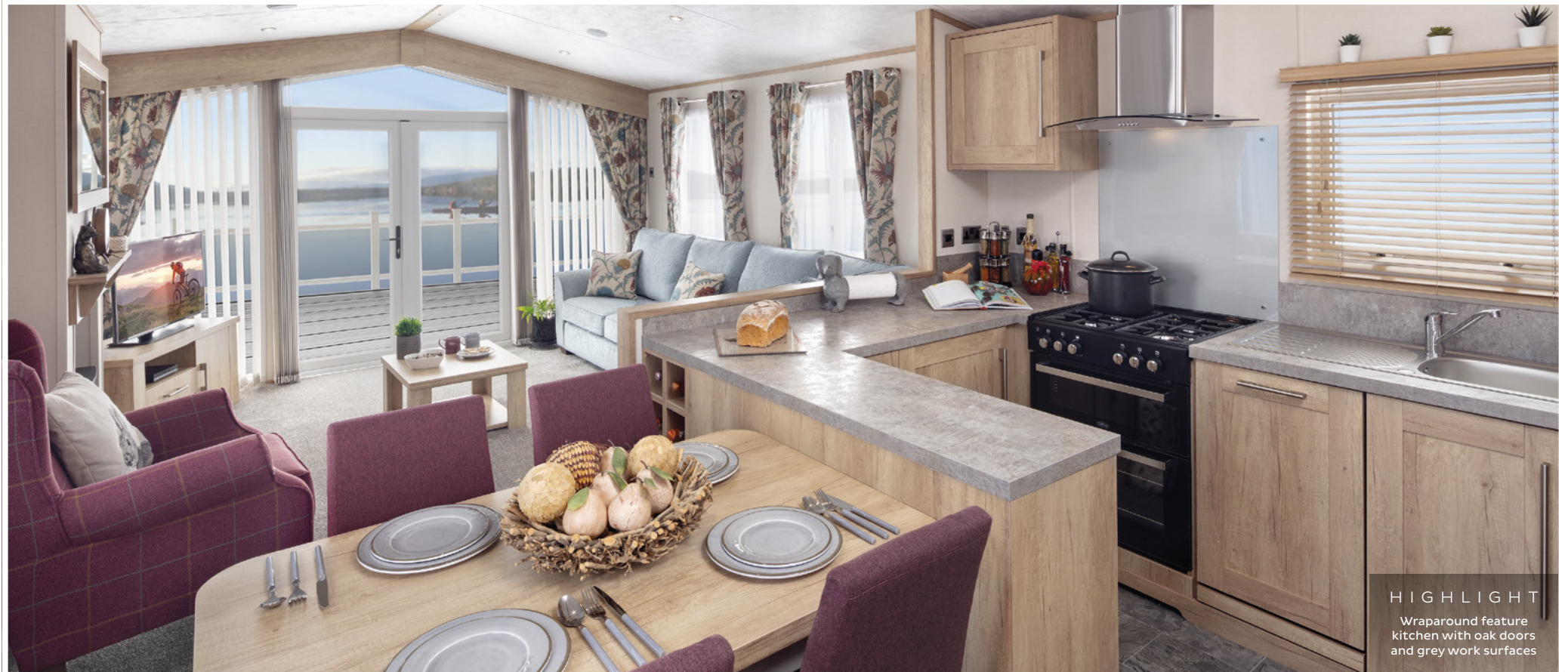
HIGHLIGHT Wraparound feature kitchen with oak doors and grey work surfaces