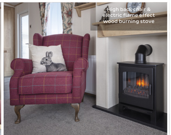
High back chair & electric flame effect wood burning stove