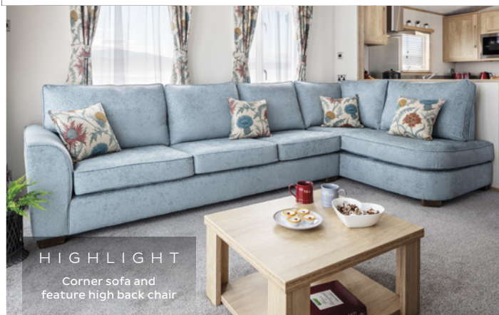
HIGHLIGHT Corner sofa and feature high back chair