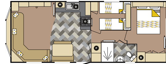
30 X 12 2B

Bed Sizes: Double 1905mm x 1370mm & 2 x Single 1830mm x 685mm